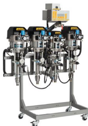
TwinControl 35-70 with extension for a second color