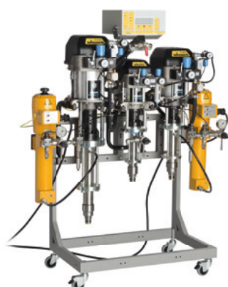
TwinControl 35-70 with material heaters for AirCoat applications