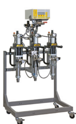
TwinControl 5-60 for airspray applications

The TwinControl can be configured for your individual application purpose.