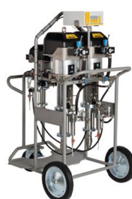
TwinControl 72-200 for heavy corrosion protection, mounted on a trolley