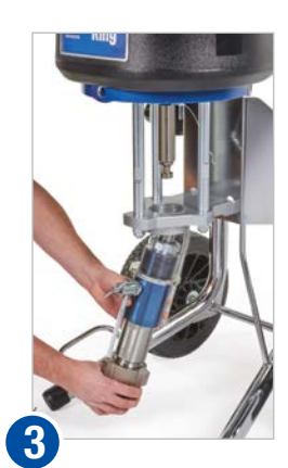
Spin pump to remove it